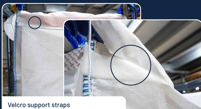
Velcro support straps

A polypropylene felt bag can be added/inserted inside the filtering big bag (SI18133). This felt improves permeability, reduces clogging and offers lower filtration thresholds (from 1 to 200 µm). The bag must be mechanically supported by the SI18133 big bag filter. The laces enable the bag to be easily strapped around the filtering big bag.