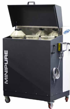
Boxed version of the MINIPURE™