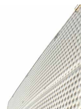
HEAT EXCHANGER Immersed heat exchanger