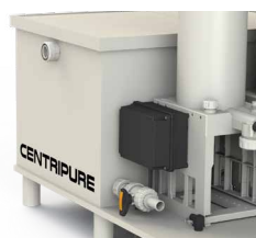
270 or 450 litre bin